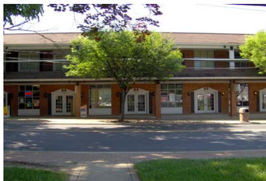
315 East Diamond Avenue Building