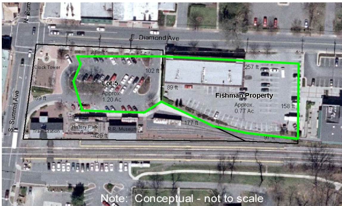
315 East Diamond Avenue Building