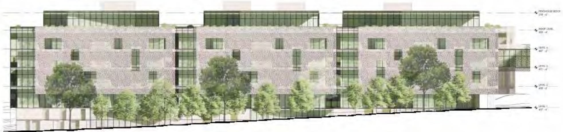
1 WEST ELEVATION - NORTH BUILDING - ENLARGED SCALE: 1/16" = 1'-0"