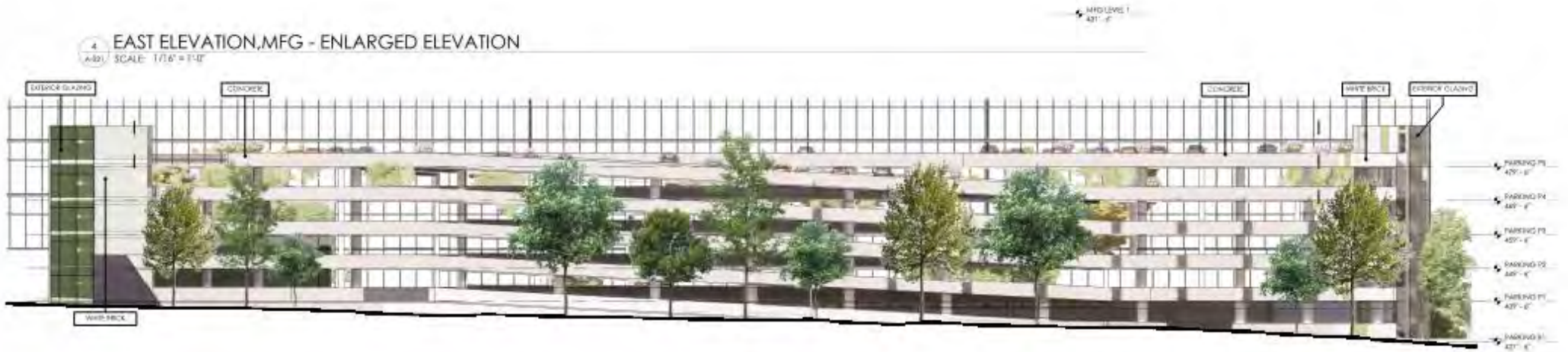
4 EAST ELEVATION, MFG - ENLARGED ELEVATION SCALE: 1/16" = 1'-0"