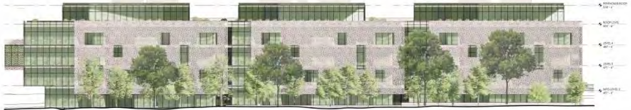
2 WEST ELEVATION - SOUTH BUILDING - ENLARGED SCALE: 1/16" = 1'-0"