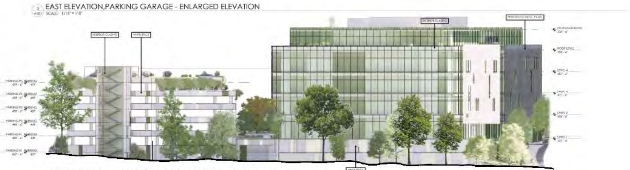
1 EAST ELEVATION, PARKING GARAGE - ENLARGED ELEVATION SCALE: 1/16" = 1'-0"