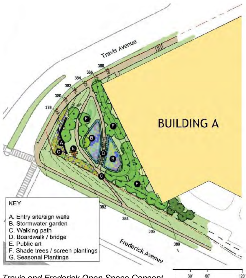
Travis and Frederick Open Space Concept, Exhibit Z20/C28

Additional exhibits submitted along with the response letter are included as Exhibit Z20/C28.