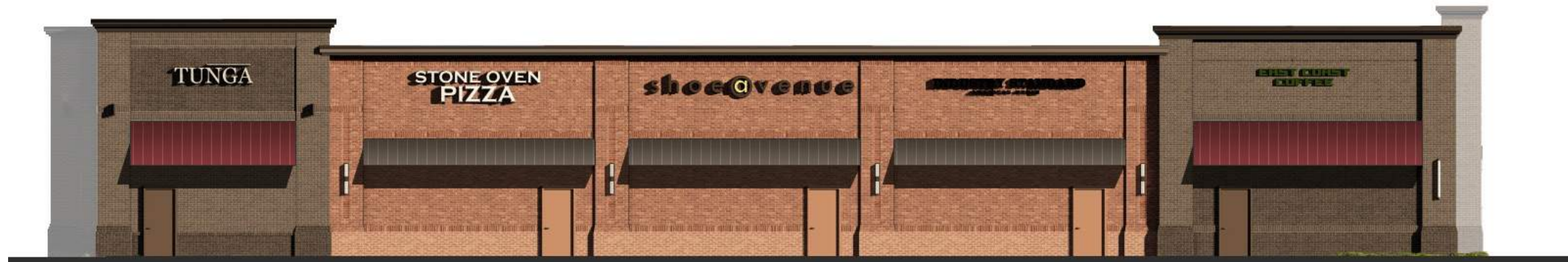
PLAN NORTH ELEVATION (REAR)