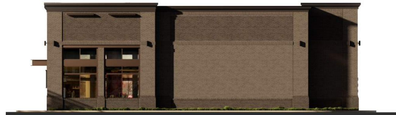
PLAN EAST ELEVATION (SIDE)