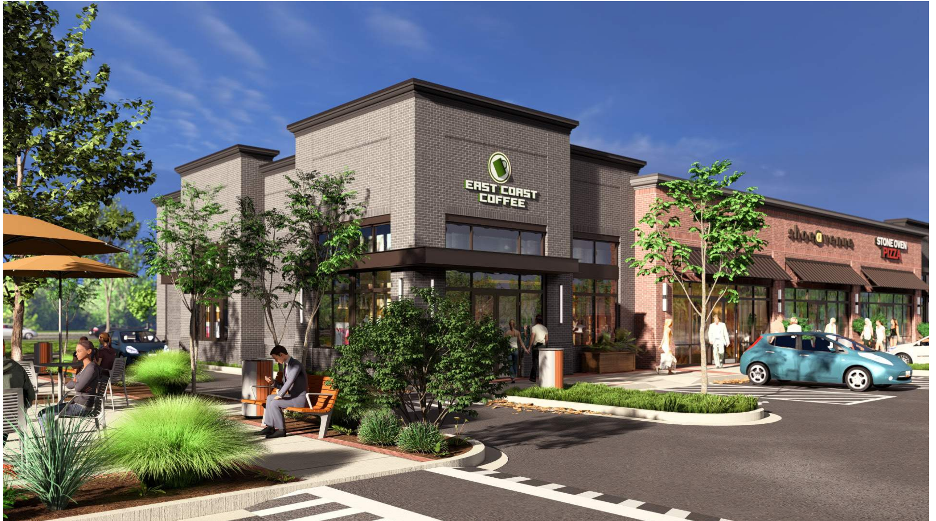
FRONT OF BUILDING - PERSPECTIVE