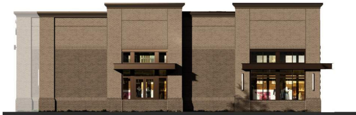
PLAN WEST ELEVATION (SIDE)