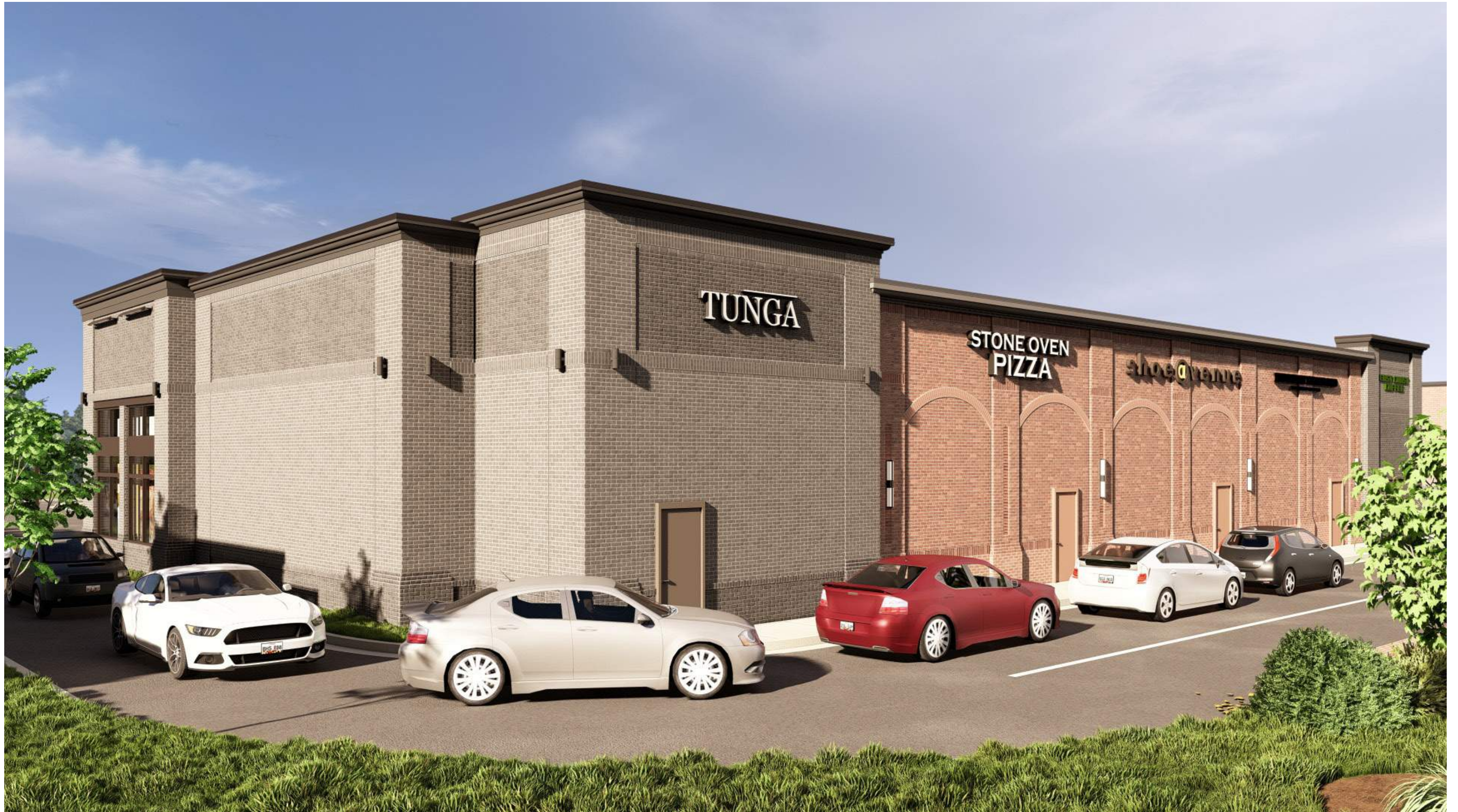
REAR OF BUILDING - PERSPECTIVE