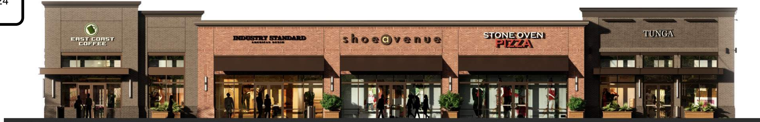
PLAN SOUTH ELEVATION (FRONT)