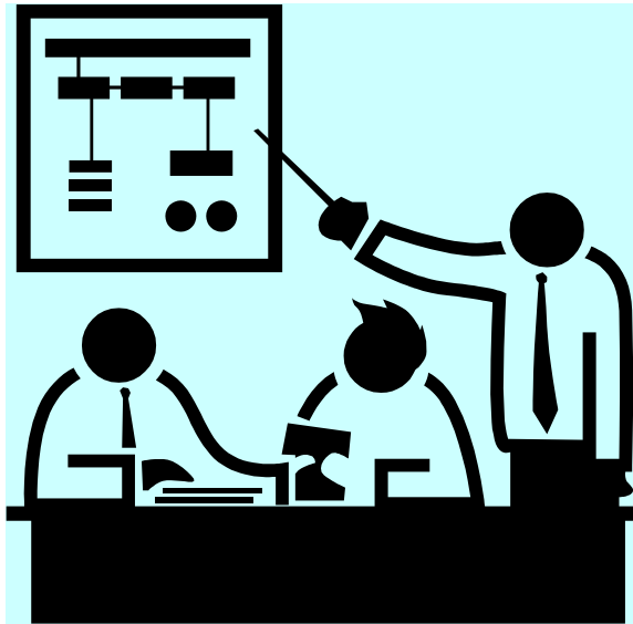
Structure of the city/town government

Elect a minimum of 3 to a maximum of 5 council members or commissioners and a mayor, burgess or president of the council/commission.