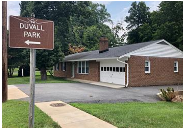
Proposed Site of DeVol's Crematorium, a former single family home near Duvall park