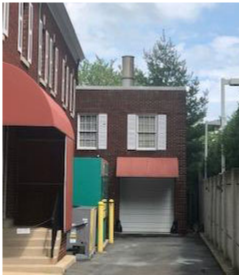
Pumphrey Funeral Home, Bethesda