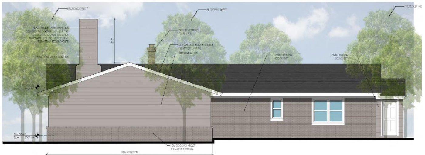
3 REAR (SOUTH) ELEVATION Scale: 1/4"=1'-0"

Exhibit #264: Revised Conceptual Building Elevations