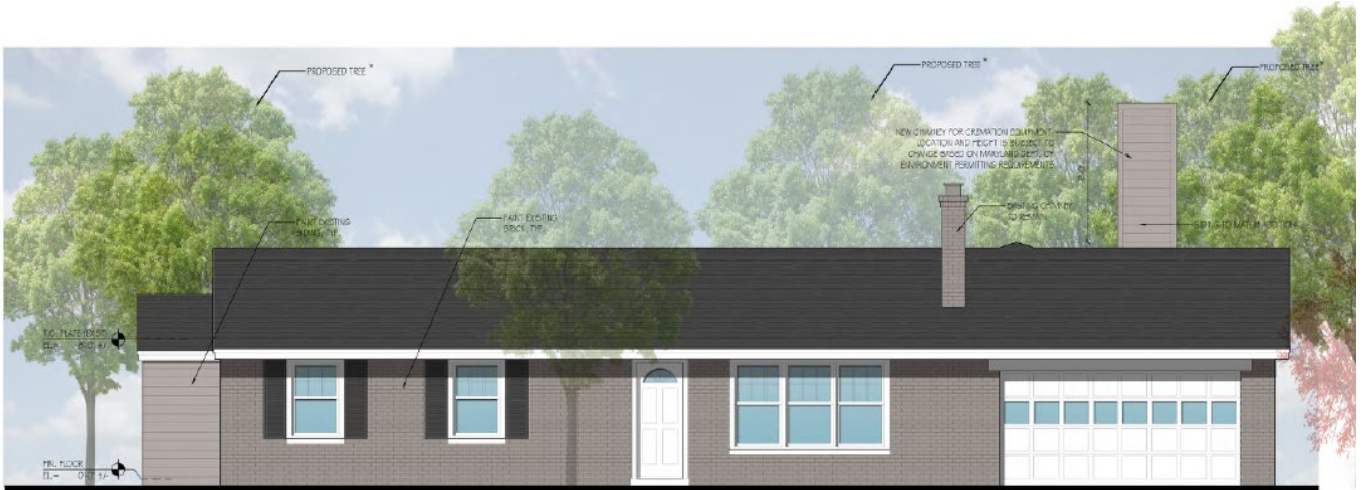
① FRONT (NORTH) ELEVATION Scale: 1/4"=1'-0"