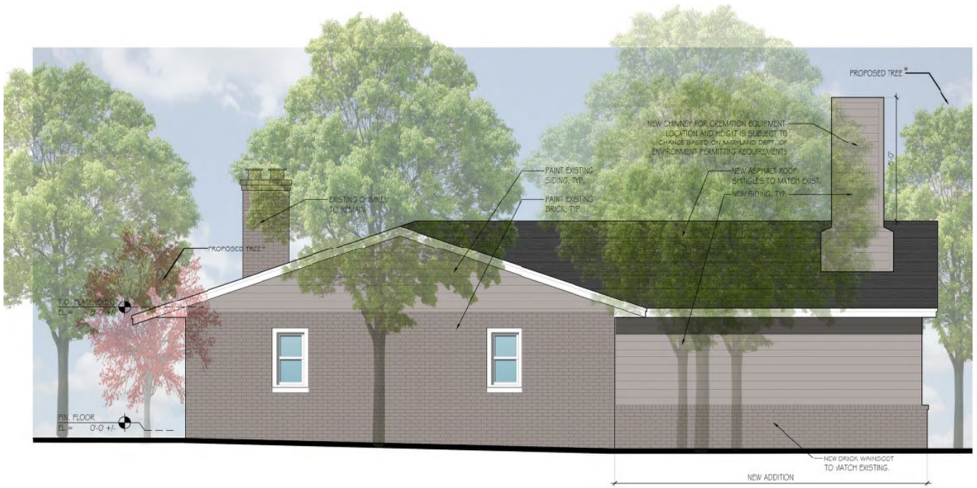
2 RIGHT SIDE (WEST) ELEVATION Scale: 1/4"=1'-0"