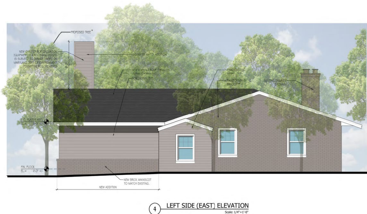
Exhibit #264: Revised Conceptual Building Elevations

to match the structure. As noted in a memo from Carol Lynn Green, the Applicant had Green Toxicology LLC, conduct an air quality analysis to determine the appropriate height of the chimney, which would fit the character of the neighborhood 8 . The analysis is based upon Maryland Department of the Environment (MDE) air pollutant standards and a maximum of four cremations in an eight hour period. The plan notes that the new chimney for the cremation equipment location and height is subject to change based on the MDE permitting requirements. The Applicant is also exploring the possibility of planting a tree to further screen the proposed chimney. The proposed trees shown on the plans demonstrate the full established growth and the location of the trees is subject to change as part of the final site plan. If the Council were to approve Concept Site Plan SP-8415-2020, Staff recommend a condition that prior to issuance of building permit, final design of the chimney stack, after determination by Maryland Department of the Environment (MDE), must be presented to the Mayor and City Council and Planning Commission for review and approval to ensure the final design, height, location, and appearance still substantially meet the findings for approval as outlined in this resolution.