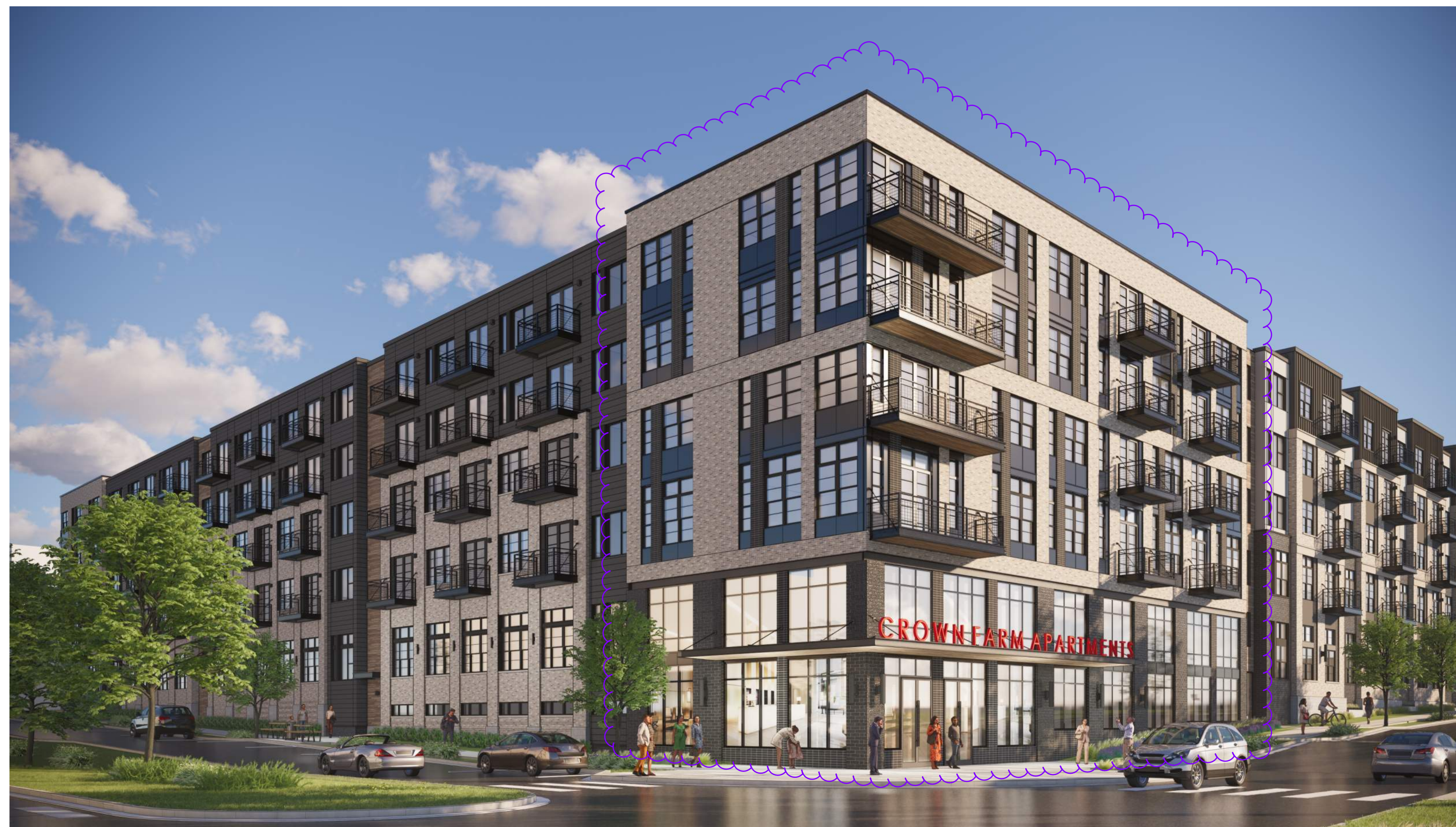
3 LEASING AMENITY CORNER RENDERING