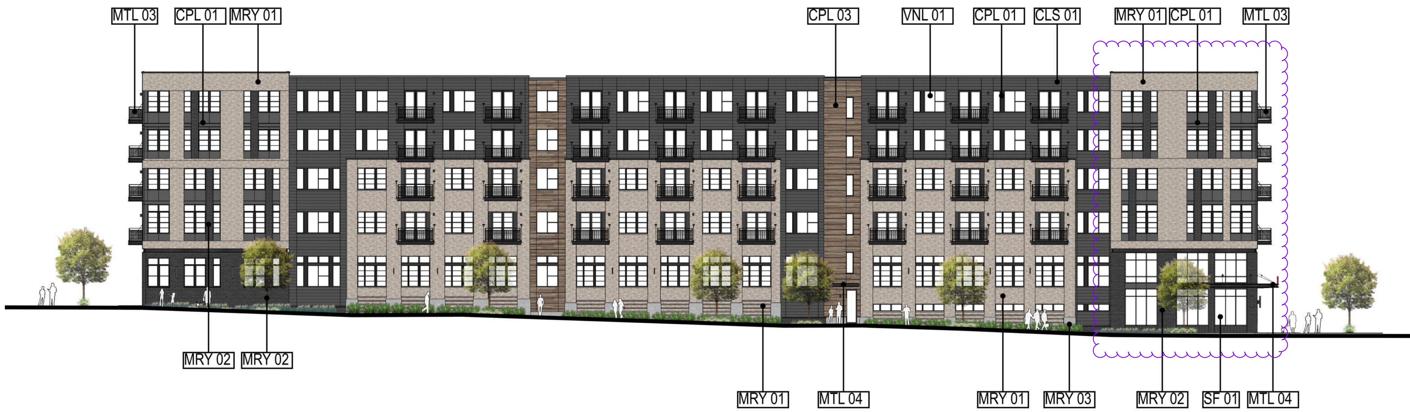
2 WEST ELEVATION - DIAMONDBACK DRIVE 1/16" = 1'-0"

JOB NUMBER: 193802 DRAWN BY: Author CHECKED BY: Checker