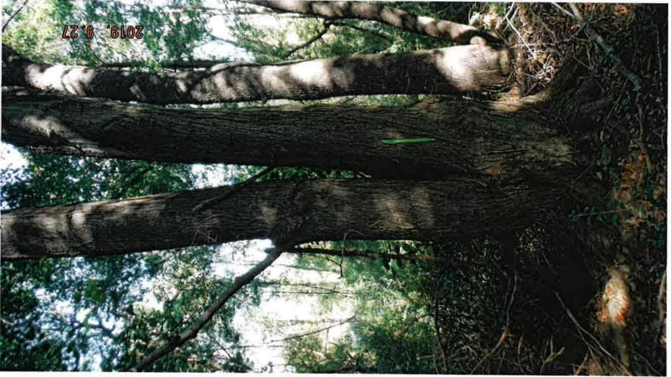
Specimen Tree #4